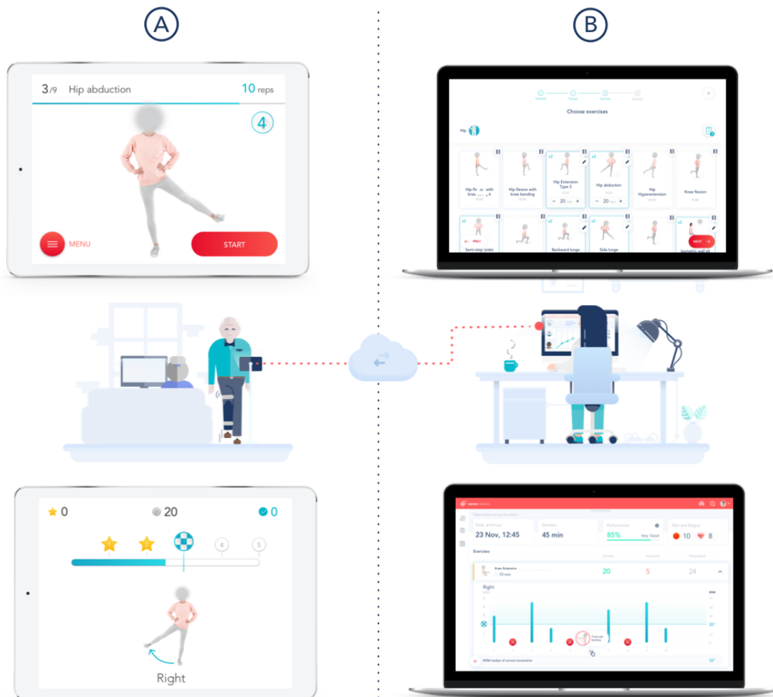
Figure 1. System components. (A) Mobile app. Preparation screen (top left): this screen displays video and audio instructions for each exercise. Execution screen (bottom left). (B) Web portal. Prescription screen (top right) displaying the exercise list and session layout. Results screen (bottom right) presenting (1) date, time, and session duration; (2) pain and fatigue scores; and (3) information on each repetition—range of motion and movement errors.

The system consisted of the elements described subsequently (Figure 1).