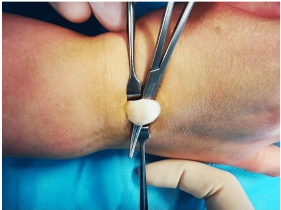
FIGURE 4: Right hand cyst excision