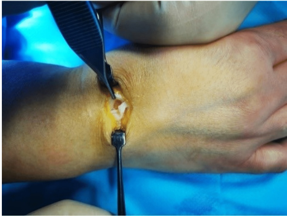
FIGURE 5: Tendon defect after the excision

After surgery, the patient was referred to the Department of Physical and Rehabilitation Medicine for evaluation. She started a rehabilitation programme consisting of cryotherapy, physiotherapy, and occupational therapy to promote cicatrization, tendon gliding, pain management, and range of motion muscle strengthening and training in ADL.