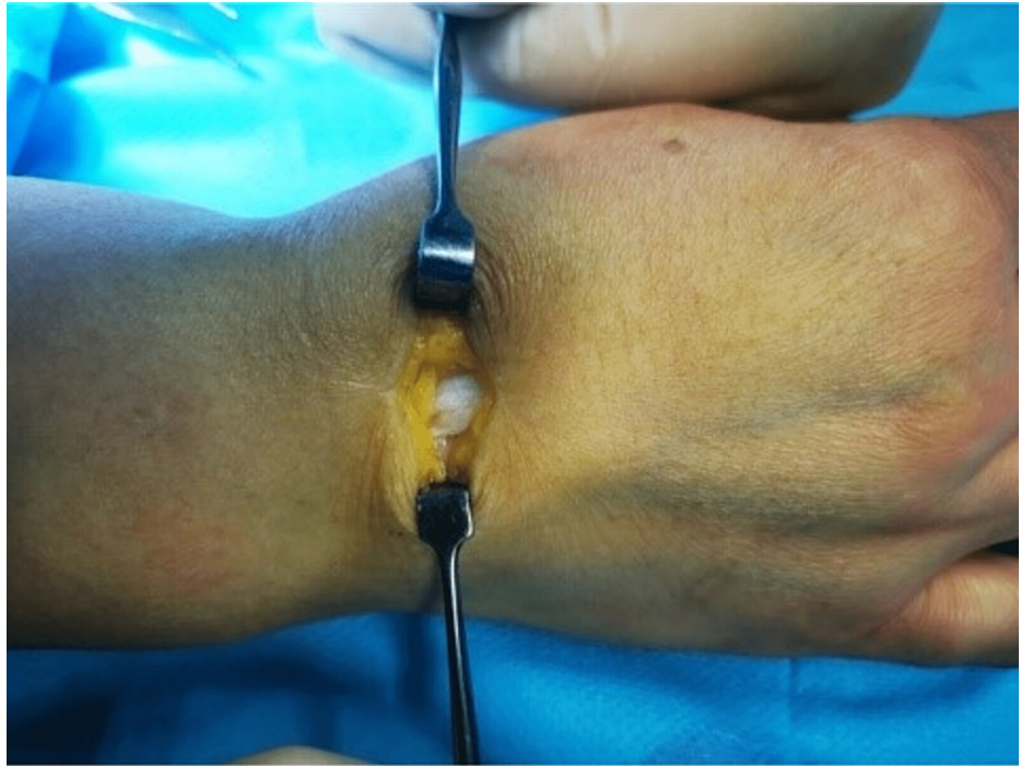
FIGURE 3: Surgical approach with identification of the tendon