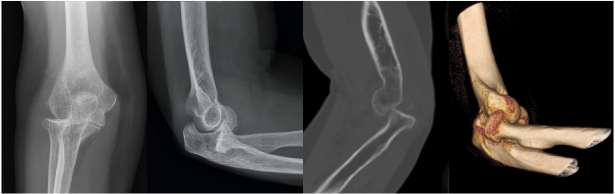
Fig. 1. X-Ray and CT scan (sagittal view and 3D reconstruction) of the right elbow, performed in the emergency department, showing a posterior isolated radial head dislocation, no evidence of fractures or other concomitant injuries.

forearm and applying pressure on the radial head (Fig. 2). Immobilization was done with an above elbow posterior cast with the elbow in 90° of flexion and slightly pronated which was maintained for four weeks. Further screening was done weekly to make sure that the radial head was in a reduced position. Active elbow mobilization was started after removal of the cast and the patient underwent a supervised physiotherapy program. At 6 months of follow-up, the patient had recovered clinically and functionally, with complete flexion-extension, 0–90° of supination, 0–80° of pronation. At 18 months of follow-up, functional outcome is excellent compared with the contralateral elbow with no differences between both sides (Fig. 3) and there was no recurrence of the lesion and the radiograph evaluation revealed no signs of complications (Fig. 4).