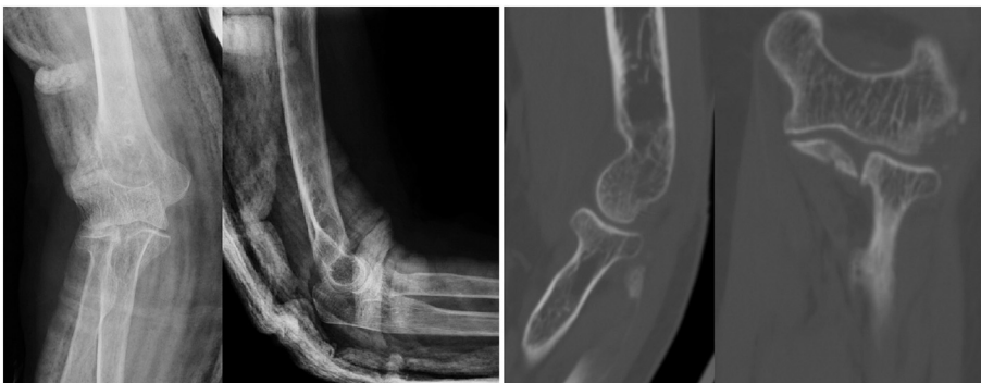
Fig. 2. X-Ray and CT-scan performed after closed reduction and immobilization, showing a correct reduction.

To diagnose and reduce the dislocation promptly is of utmost importance. It can be easily missed on elbow radiographs and it is of paramount importance to have a high level of suspicion. The CT-scan seems important in this setting to identify the isolated radial head dislocation and exclude concomitant injuries. There is no consensus on which position of forearm rotation is best for