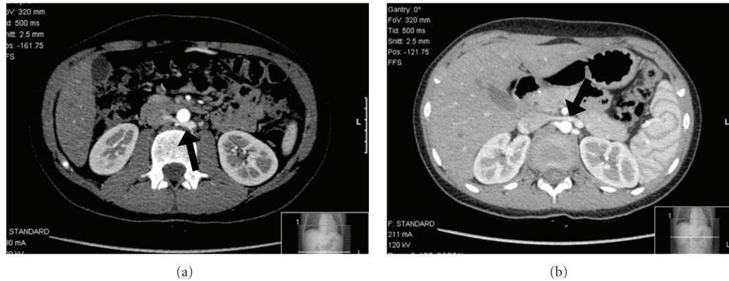
FIGURE 3: (a) Posterior branch of the left renal vein entrapment; (b) normal anterior left renal Vein.

The renal nutcracker syndrome management evolved in the last four decades [4, 9, 15], and there are several available options, from close expectant surveillance, endoscopic proceedings (e.g., external or internal stenting [16], and haemostatic agents) to more complex open surgical procedures (e.g., LRV transposition, renal autotransplantation of the left kidney [15, 17]). Patients in prepubertal age should be offered less aggressive forms of treatment since the likelihood of spontaneous remission due to normal physical development [6].