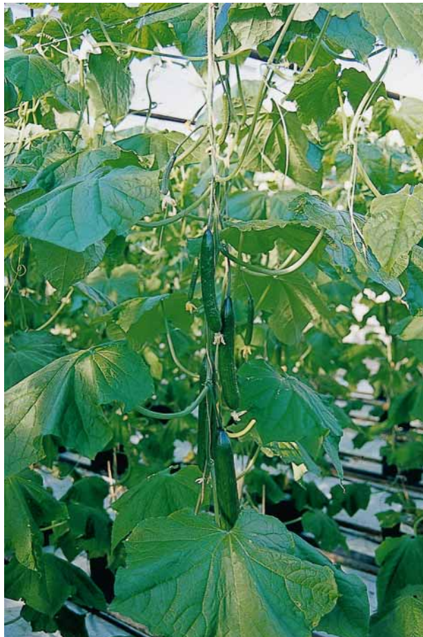
Fig. 1. Cucumber plant.

Patch tests with the European standard series, a preservatives series, cucumber stalk, and upper and lower sides of the leaf, gave the results shown in Table 1. As the plants might have been painted with a biological compound against mildew, we retested the patient with fresh non-painted young plants with similar results. Prick tests showed a positive reaction to house dust mite and itching with both sides of cucumber leaf.