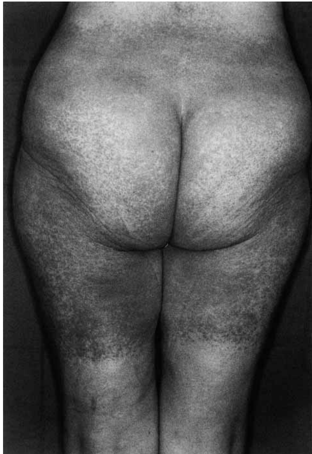
Fig. 1. Allergic contact dermatitis from diphenylthiourea in a neoprene slimming suit.

A 51-year-old woman, with a previous history of asthma and rhinitis, developed a pruritic erythematovesicular eruption on the upper thighs and buttocks, after wearing a Vulkan ® neoprene slimming suit (Fig. 1). The results of patch tests with a standard series, a rubber chemical series (including thiourea derivatives) and a piece of neoprene fabric from the slimming suit are summarized in Table 1.